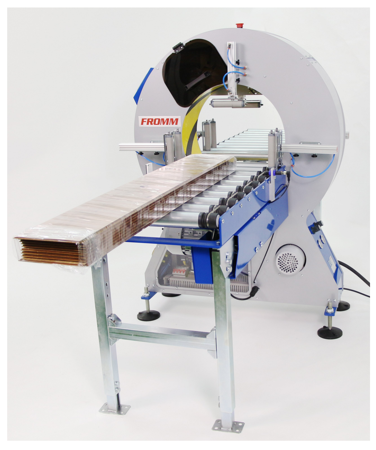
Easy packaging without limits!